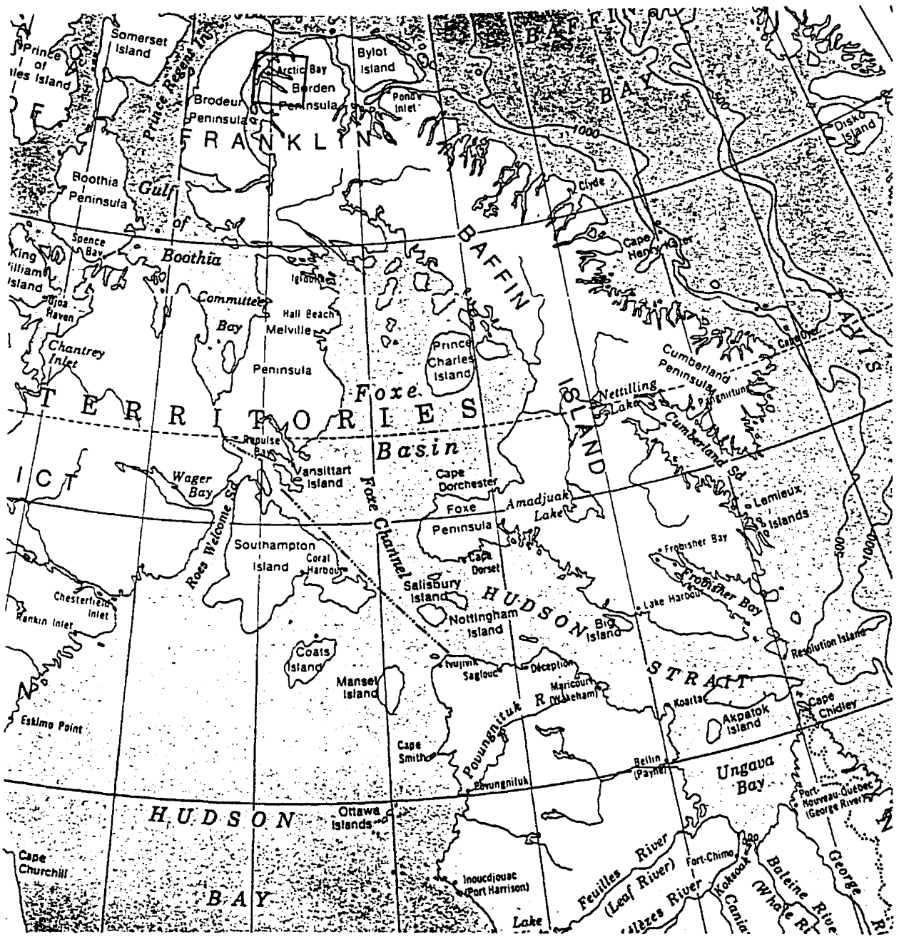
Detail of Map of Canada (1973) produced by Department of Energy, Mines and Resources, Canada. (Square indicates location of map in Figure 3.2, next page.)