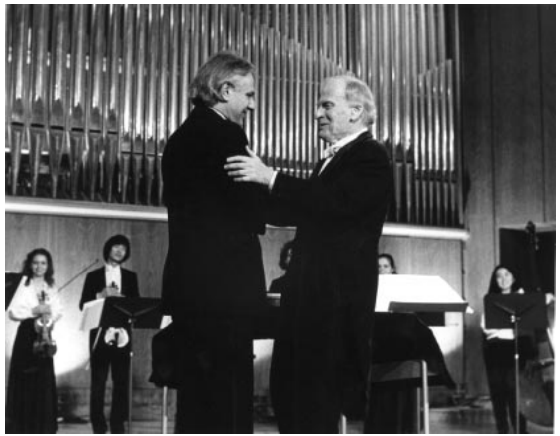
André Prévost and Sir Yehudi Menuhin during the premiere of the Cantate pour cordes, 1987.

MUS 264/H1,5 \it C\'el\'ebration. - 1966. - 1 audio tape (8 min. 5 sec.): polyester; 19 cm/sec.; reel: 13 cm.